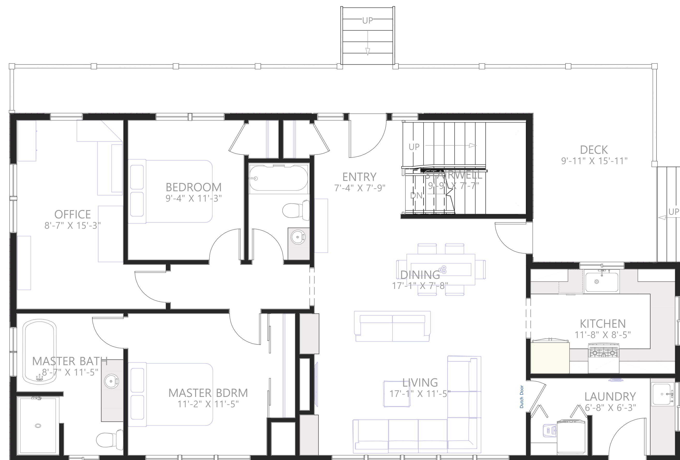
A1.1 Main Floor Plan

1.5 story with garage in basement 2100 sq ft living space on primary floors, potential extra finished space in basement 4 bedroom 3 bath with office/guest room on ground floor